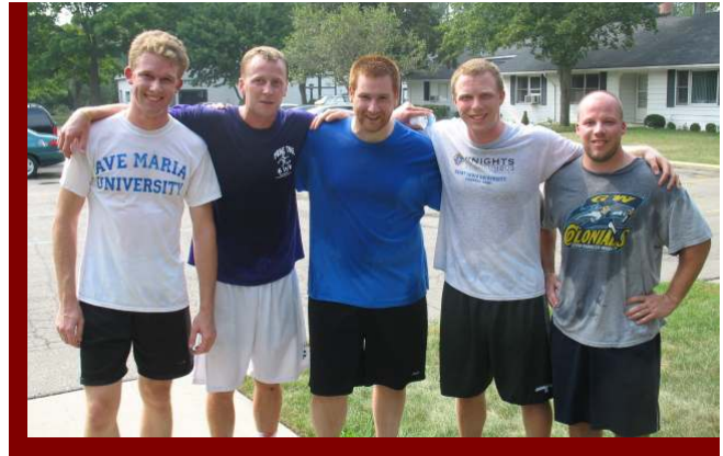
Seminarists taking a break after an intense game of soccer

Throughout the summer the seminarists are very busy with summer obligations, including parish assignments across the Archdiocese, retreats, pilgrimages, camps, and jobs, so they rarely get to spend time with each other. The annual gathering provides a great opportunity for the seminarists to grow in fellowship and build a "sacramental brotherhood". The gathering also provides a