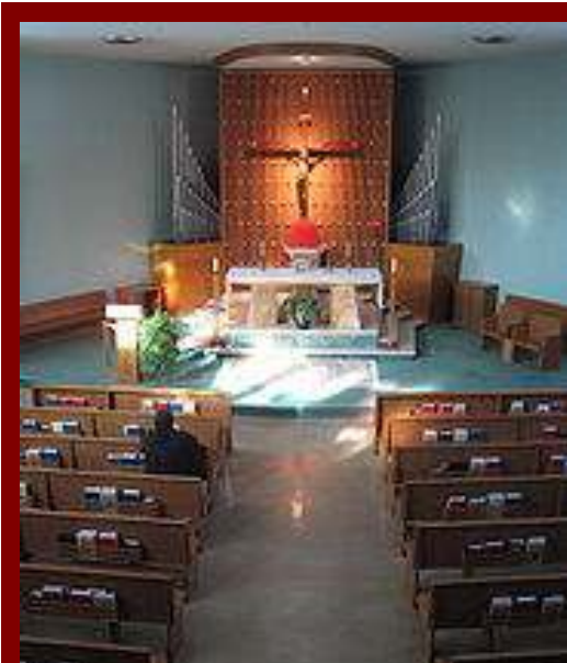
The Chapel at Blessed John XXIII